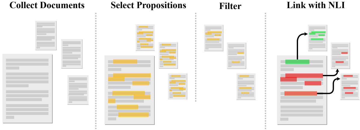
Figure 2: The four stages of the NewsReader linking pipeline: Article collection, Claim detection, claim filtering, and claim linking