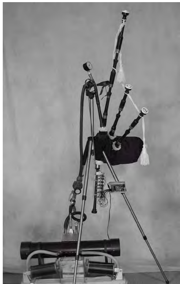
Figure 3. McBlare, Carnegie Mellon's robotic bagpipe player.