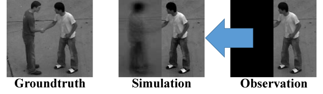
Figure 1: Examples of ground truth, partial observation, and visual simulation over occluded regions.

We follow (Huang and Kitani 2014) and model dual-agent interaction as a MDP in the following way. We use a high-