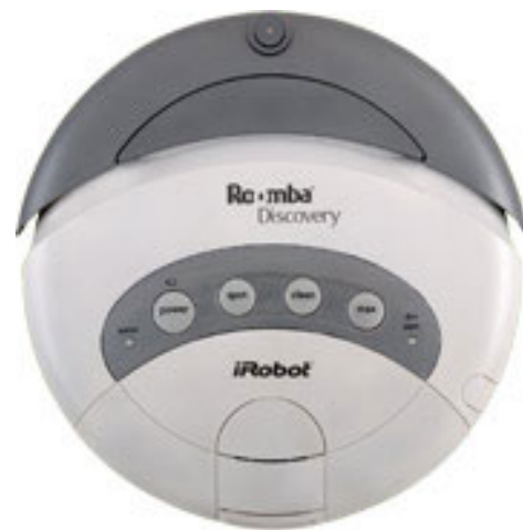
Figure 1. Roomba Discovery vacuum.

The sensor systems in the Roomba, along with most home floor