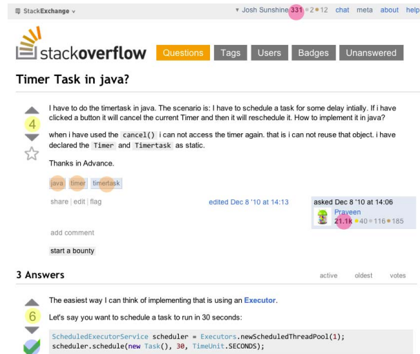
Fig. 1. Screen snap of the StackOverflow question page.

We mined Stack Overflow, a widely-used developer forum, primarily to identify the characteristics of protocol tasks that are difficult for programmers (RQ1). We discuss the strengths and weaknesses of StackOverflow data in Section IV-A. We downloaded the entire Stack Overflow database which is freely available to anyone under a Creative Commons license. When this study was conducted there were 2.6 million questions on Stack Overflow. This is far too many to read and digest, so we winnowed the question list with the techniques we discuss in Section IV-B. The goal of the filtering was to focus our efforts on questions that were likely to be protocol-related and significant. Once we had a reasonable-sized list of questions, we manually read each questions to: 1) determine if the question was protocol-related, 2) distill a task, and 3) merge with existing tasks. This study’s aim is to characterize recurring protocol problems, but does not attempt to estimate commonality. The study also required a lot of manual labor, so we likely excluded many protocol question for the sake of efficiency. The strategies we used in all of these efforts are discussed in Section IV-C.