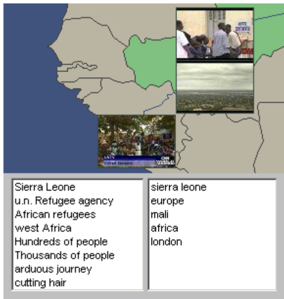
Figure 2. Map collage after zooming into a subset of Africa from the collage shown in Figure 1.

user is reached, with one image per tile, the highest-scoring regions reserving tiles first. Advantages of this approach include images that don't obscure each other, and images are located by the countries they describe. The obvious disadvantage to this approach is that countries with large areas have greater potential to show more images. The overlapping image view used in timeline collages will be investigated with maps as well.