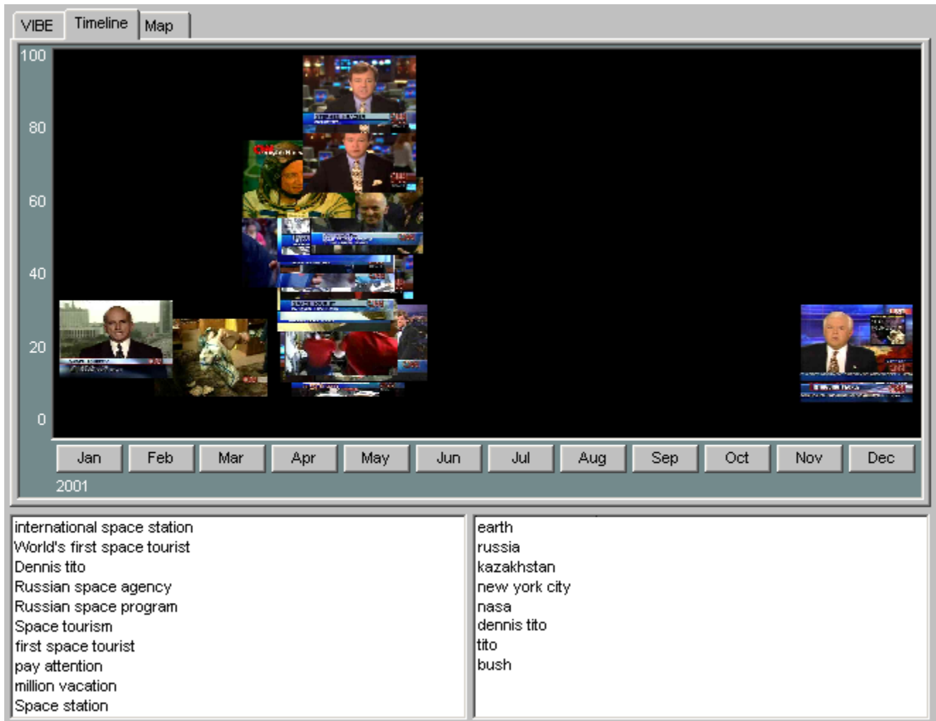
Figure 7. Collage generated from 20 video documents returned from "Dennis Tito" query.