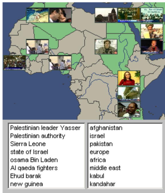
Figure 1. Map collage, with common phrases and frequent locations for documents pertaining to Africa.

Consider a user interested in finding geographic distribution on reports of political asylum and refugees in 2001 news. Following a query on these words, 126 video documents are returned. At an average of 2 minutes per document, the user would need over 4 hours to examine all of the material, possibly without retaining an overview of how these stories relate to countries in Africa and the Middle East. If this became the subject of inquiry, the user could open up a map collage and use the standard map interface tools of pan and zoom to select to see this region of interest, as shown in Figure 1.