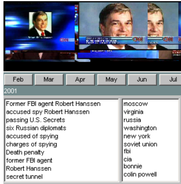
Figure 5. Collage for "Robert Hanssen" from 2001 news set.

Beyond the utility of their text contents as summaries, collages also offer the benefits of folding in imagery and layout, such as seeing a head shot of "Robert Hanssen" in Figure 5. Layout communicates information as well, e.g., seeing the bounds of story reports (February, June) on Nkosi Johnson in Figure 6, and seeing the density of reports on Dennis Tito in May in Figure 7, or seeing geographic distributions via map collages. A straightforward comparison of the collage's text indicates its value as a briefing tool, a value that is enhanced through additional information within the collage. In addition, the collage's interactive nature supports dynamic exploration and revealing of further detail in subsets of interest.