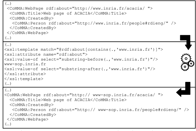
Figure 4. XSLT agent propagating the update of a URI

As an example, let us consider the case where the update is due to the change of the URI of a resource. Figure 4 presents three frames: an example of annotation to be corrected; the XSLT core for correction; the annotation after correction. This fairly simple case illustrates the use of a specialized type of reactive agents, tailored by an information agent to propagate a task over the whole memory. A population of such XSLT agents can be generated automatically by an intelligent agent or through interface manipulation and generic libraries of templates.