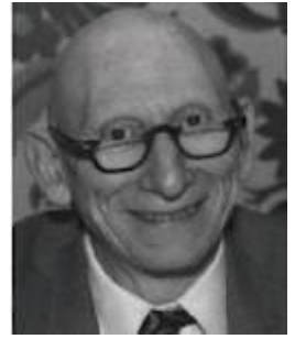
Alan Perlis First Department Chair

Led by a group of visionary enthusiasts, including Allen Newell, Herbert Simon, and Alan Perlis, the Department of Computer Science was formed in July 1965, with Alan Perlis as its head. As one of the first such departments in the nation, its creation was