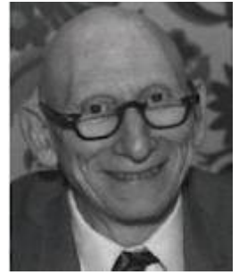
Alan Perlis First Department Chair

Led by a group of visionary enthusiasts, including Allen Newell, Herbert Simon, and Alan Perlis, the Department of Computer Science was formed in July 1965, with Alan Perlis as its head. As one of the first such departments in the nation, its creation was