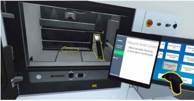
Fig. 1. A student operating the VR-based AM Training Tutor for the EOS M290 AM machine

In order to reduce this requirement as much as realistically possible, current efforts are focused on transforming the tutor into a generalized framework with the specific goal of making the VR application versatile enough that it will not require recompiling the application every time tutorials for new AM machines are created.