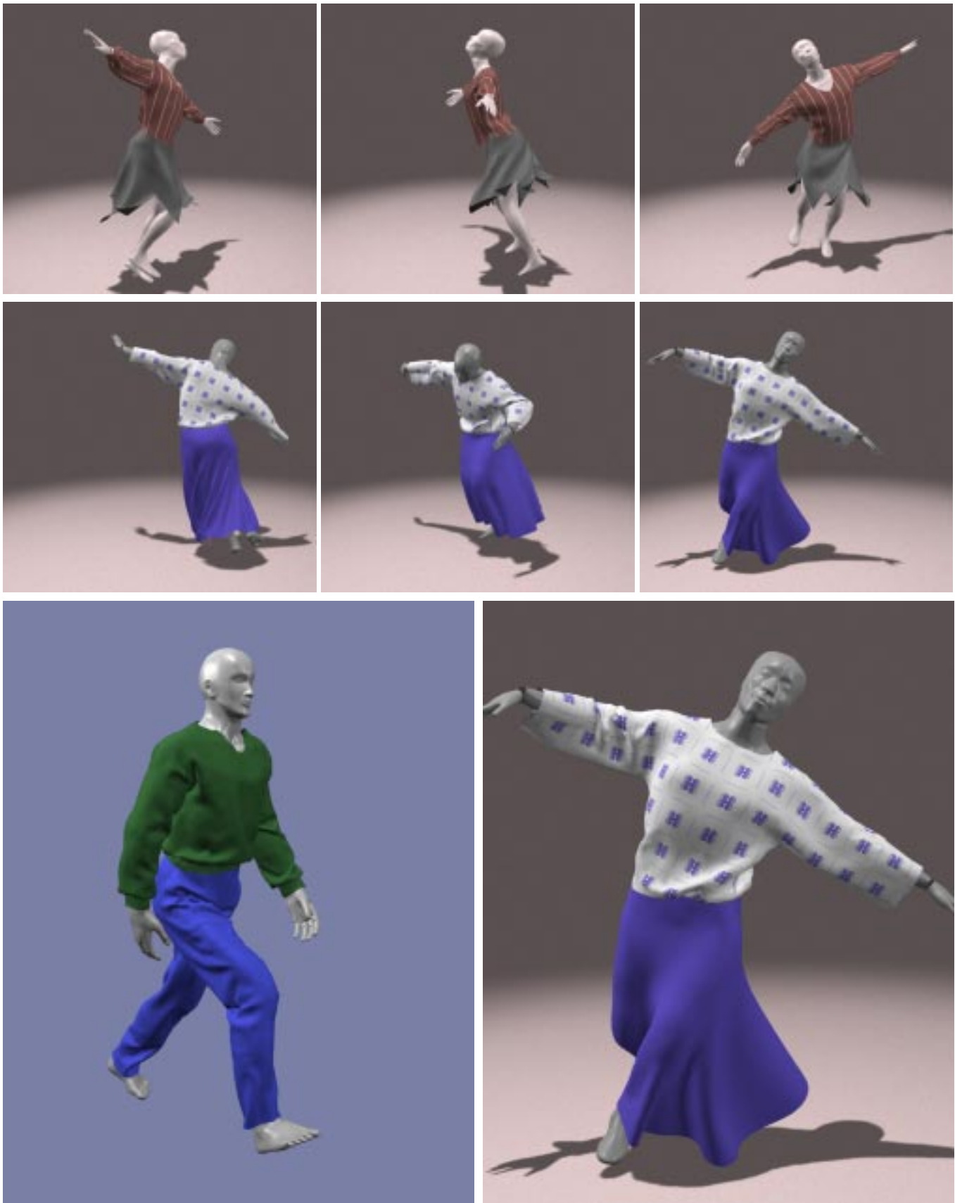
Figure 5 (top row): Dancer with short skirt; frames 110, 136 and 155. Figure 6 (middle row): Dancer with long skirt; frames 185, 215 and 236. Figure 7 (bottom row): Closeups from figures 4 and 6.