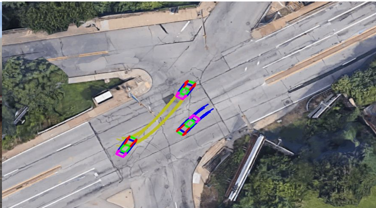
4D Activity Reconstruction