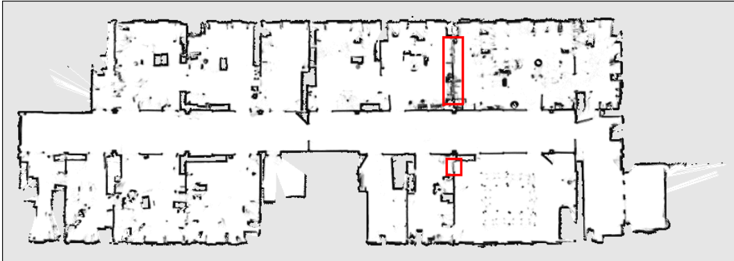
Figure 4: A map produced using a density mapping technique. Regions in red indicate glass walls which are indicated as having partial returns.