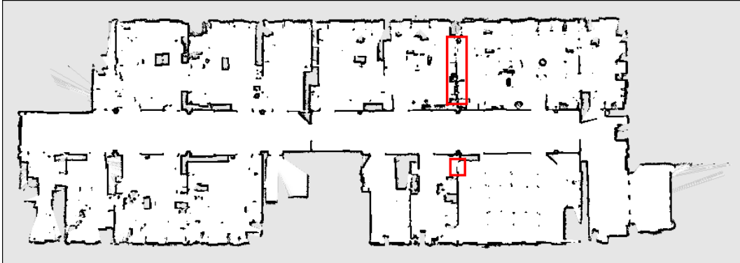
Figure 3: A map produced using an occupancy mapping technique. Regions in red indicate glass walls which are indicated as being either fully occupied or non-occupied.