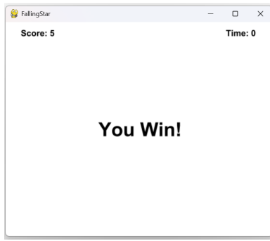
(b) User Wins