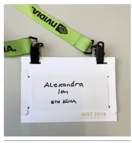
Figure 2. An example badge from our initial experiments with making paper badges for the conference in order to eliminate single-use plastics.

During UIST '19, we talked with the chefs and liaisons for our venues to negotiate low-impact meals. We developed a more comprehensive understanding of the trade-offs involved through these conversations. For example, current research on the U.K. diet suggests fish-based, vegan, and vegetarian diets contribute lower emissions than high or medium meateating diets. Yet, our experience working with an American coastal hotel that made ample use of local supply chains in sourcing the kitchen's produce, cheeses, meats, and fish suggested that the national database's standardized GHG emissions may not have reflected our decision-making context. Specifically, the GHG emissions for many dietary items in the U.S. can be high because of the food miles involved. However, rather than travel inland through air freight, high GHG emitting items like fish, meats, and cheeses for our conference would come mere miles and through sustainability-conscious ecosystems such as fisheries managed and policed by the city and supportive of local economies. As one example, we confronted a choice to increase the dietary costs of the conference by purchasing oysters. Despite cost increases, this would benefit the local oystertecture program that was designed to revitalize the seaboard and adapt the local landscape to climate change risks of flooding by creating living