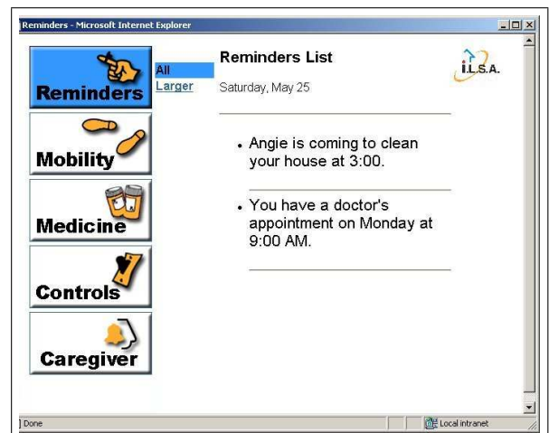
Figure 2: A sample webpage from the elder user interface.

Caregivers could access I.L.S.A. data about their client/family member with their normal ISP Web connection. The caregiver Web interface allowed the caregiver to view and acknowledge alerts, view general ADL status (including historical trends for medication and mobility, view and edit prescription and medication schedule, and set up