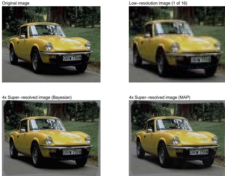
Figure 1: Example using synthetically generated data showing ( top left ) the original image, ( top right ) an example low resolution image and ( bottom left ) the inferred super-resolved image. Also shown, in ( bottom right ), is a comparison super-resolved image obtained by joint optimization with respect to the super-resolved image and the parameters, demonstrating the significantly poorer result.

In Figure 1(a) we show the original image, together with an example low resolution image in Figure 1(b). Figure 1(c) shows the super-resolved image obtained using our Bayesian approach. We see that the super-resolved image is of dramatically better quality than the low resolution images from which it is inferred. The converged value for the PSF width parameter is \gamma = 1.94 , close to the true value 2.0.