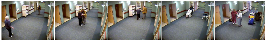
Figure 1 Examples of interaction patterns in a nursing home.

A large number of algorithmic sensors have been proposed to detect activities from audio and visual signals, including gait recognition [3], hand gesture analysis [11], facial expression understanding [10], sitting, standing and walking analysis [23], and speech detection [26]. Hudson, et. al examined the feasibility of using sensors and statistical models to estimate human interruptibility in an office environment [18]. These sensors are still mostly research challenges today, but can be potentially applicable in the future. Combinations of these sensors for analyzing human behaviors have been applied in some constrained environment, such as meeting rooms [36] and sports fields [19].