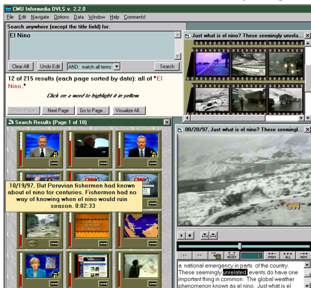
Figure 1. IDVL interface showing 12 documents returned for “El Niño” query along with different multimedia abstractions for certain documents.

Our approach uniquely combines speech recognition, image understanding, and natural language processing technology to automatically transcribe, segment and index the linear video. These same tools are applied to accomplish intelligent video search, navigation and selective retrieval. The process automatically generates various summaries for each story segment: