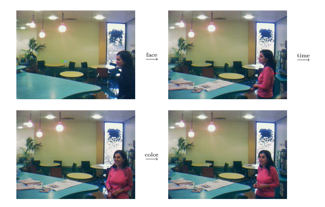
Figure 6. An example "gradient walk" on the graph. The walk starts from an unlabeled image, through assorted edges, and ends at a labeled image.

Classification of an unlabeled point i is achieved by finding \operatorname{argmax}_c a_c Y_u(i,c) . In the experiments below we report the accuracy of both the harmonic function and CMN.