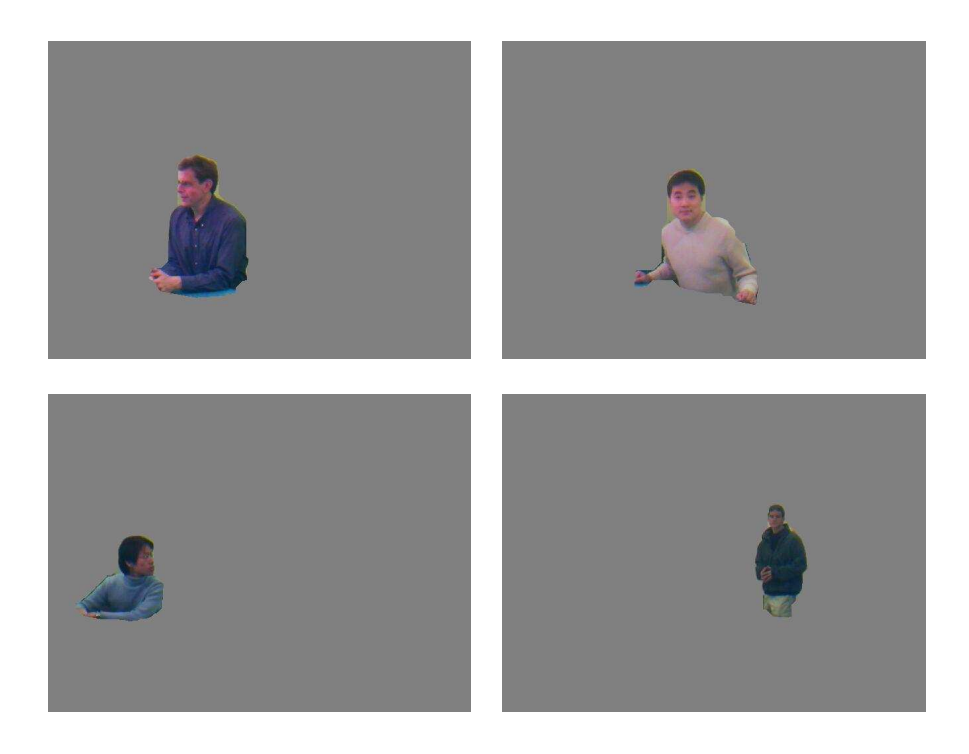
Figure 3. Examples of foregrounds extracted by background subtraction and morphological transforms.