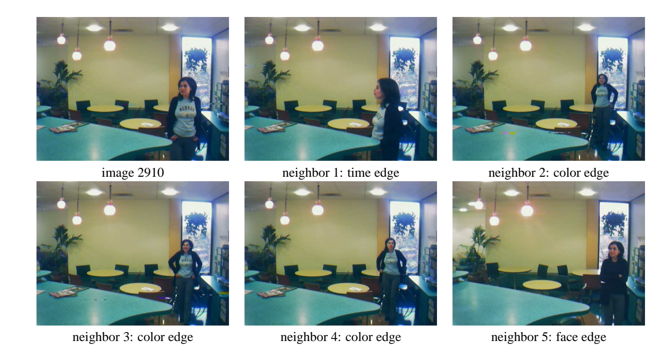
Figure 5. A random image and its neighbors in the graph.