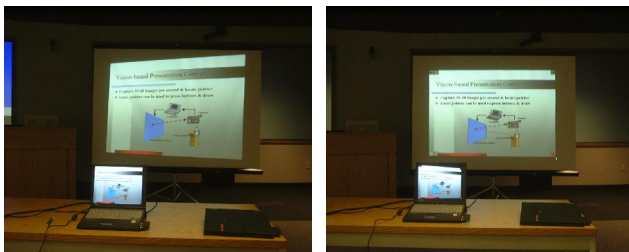
Figure 1: Automatic keystone correction.

The image generated by an off-center projector appears distorted (Figure 1, left). Using an uncalibrated camera pointed at the presentation screen, our system automatically recovers the projector-to-screen homography and pre-warps the computer output to produce a keystone-corrected image (Figure 1, right). This allows the presenter to place the microportable projector anywhere in the room without sacrificing presentation quality. Automatic keystone correction is also attractive in a home theater application where the user could place a microportable projector on a bookshelf at the side of the room and project an undistorted movie on an adjacent wall.