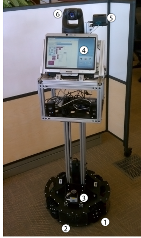
Fig. 1. CoBot-2 is equipped with 1) an omnidirectional base; 2) a 4 hour onboard battery supply; 3) a Hokuyo LIDAR sensor to detect obstacles; 4) a touch-screen tablet with wireless for onboard processing; 5) a StarGazer sensor; and 6) a pan/tilt/zoom camera.

when moving to a global position. In the rare event that localization fails and CoBot-2 is unaware of its position, it may ask a human for help, who will click a map to set the localization position [14].