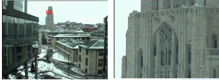
Fig. 4. At left, the robot views a scene at the default zoom level. At right, the user zooms in to the boxed area at the maximum level of 18X. The powerful zoom functionality of the robot allows users to inspect small or distant objects, and even read text remotely.

A 320x240 image from CoBot-2's camera is displayed at the top of the display, and refreshed every fifth of a second. Network latency is manageable enough that overseas users can control CoBot-2 without difficulty.