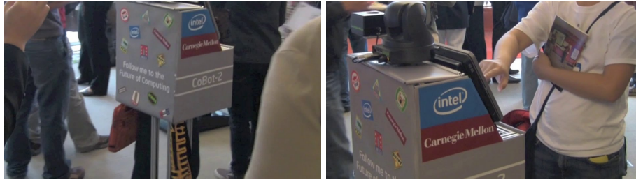
Fig. 2. CoBot-2 successfully navigated through dense crowds autonomously at the open house for an entire day, guiding visitors to exhibits.