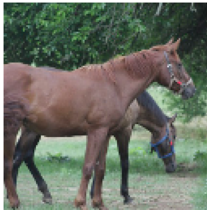
Figure 4: Image of a horse from the MS-COCO dataset, downsampled to 128x128

Figure 4 illustrates one such image from the MS-COCO dataset 2 .