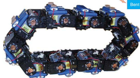
Treading lightly. In "wheel" configuration, Yim's PolyBots move by consulting a gait-control table that cycles each module through four different states.

So far, no modular robot has stepped, rolled, or slithered out of the laboratory to prove its mettle in the real world. But that may change soon. Recently, Yim's group was