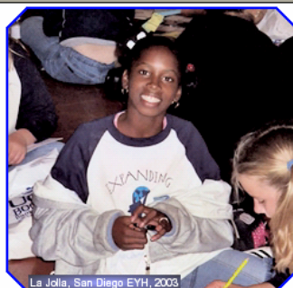
La Jolla, San Diego EYH, 2003