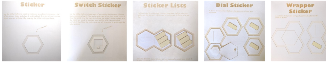
■ Figure 3 Above is a view of each sticker type on its own page in the IoT Codex. From left to right: button, toggle, list, dial, and wrapper.

identity, gathering of the specific platform resources that will be used, and finally, invoking the desired action. For example, a Sticker could encapsulate the following rule: if one RFID associated with a toggle switch Sticker disappeared, while another appeared (indicating that the switch has shifted positions as in Figure 2), then a state change should be logged. This could achieve higher level use cases like tracking whether a pet cat had been fed (as depicted in Figure 1). 5 different basic sticker types are currently supported by the system: a button, a toggle, a list, a dial, and a wrapper (these are detailed more below).