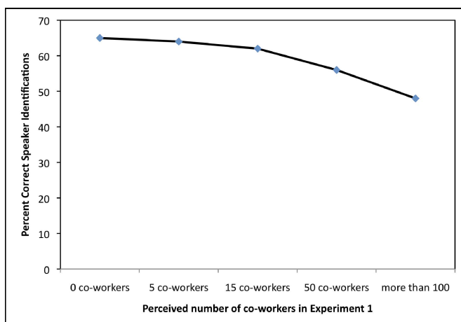
Figure 3. Perceived number of co-workers negatively affects work quality (Experiment 1).

In summary, our results show that increasing the number of displayed coworkers positively influences perceived coworkers, which in turn reduces work quality.