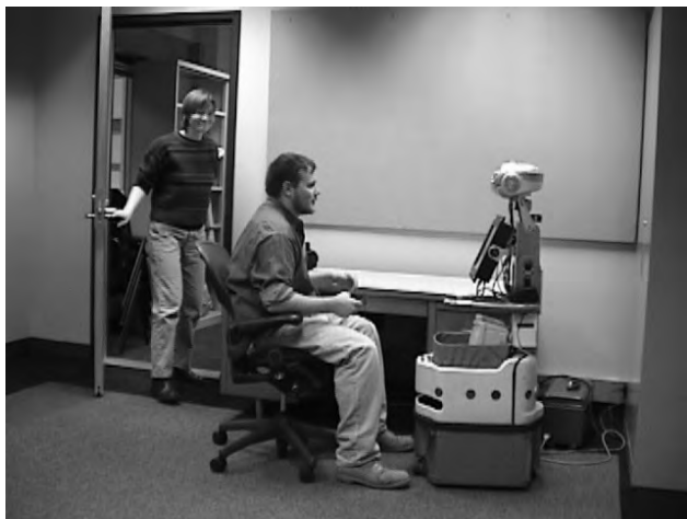
Figure 2. Robot and participant.

Twenty-one participants were randomly assigned to interact with either the serious ( n = 11 ) or the playful ( n = 10 ) robot. Participants averaged 25 years old. There were 9 females and 13 males. (We report only results from native English speakers because nonnative speakers frequently failed to understand the robot's simulated speech.)