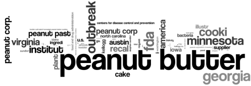
Figure 2: Topic representing the peanut butter recall from January 18, 2009, with the size of a word proportional to its importance in the topic.

TDN+NE to four popular blog aggregation sites: the front page of Digg, Google Blog Search, Nielsen BuzzMetrics’ BlogPulse, and Yahoo! Buzz. We intended on evaluating Technorati as well, but their RSS feed was unavailable for most days in our evaluation period. Additionally, we also examine the performance of simpler objective functions on the post selection task.