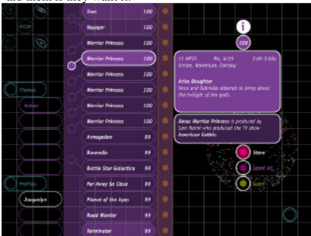
Figure 1. Screen from our TV show recommender

The short, conversational sentence works well with our TV recommender. The users' main task is to find a TV program to watch or record. They may browse hundreds of options from the 10,000+ shows on each week. The small sentence does not intrude on them, forcing them to consider watching something new. Instead, it waits unobtrusively to aid them if they want it.