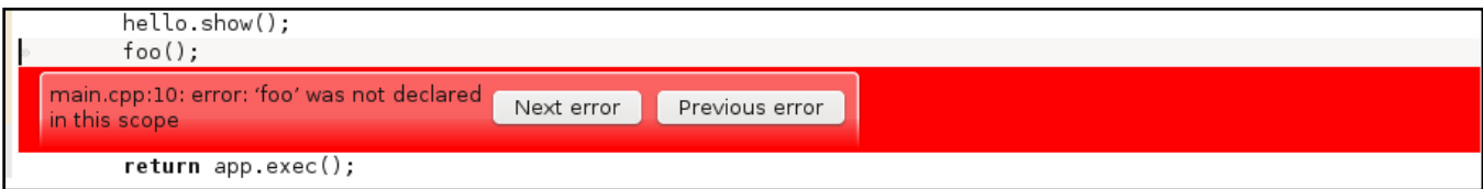
Picture 3. Inline error message.