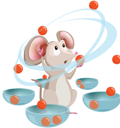
Figure 19.1 Throwing balls into bins uniformly at random.

We now turn to a very different application of tail bounds, illustrated in Figure 19.1, where balls are thrown uniformly at random into bins.