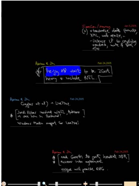
Fig. 2. Deployed version of the display

Basing our design on the prototype evaluations, we built the deployed system (Fig. 2) using C#, the Microsoft Tablet PC SDK 1.7, and Microsoft Journal Reader SDK 1.7. The system converts all of the user's digital ink notes into XML, parses them into asterisk-marked, highlighted and unannotated fragments, and renders the resulting InkObjects onto the screen according to a simple algorithm. The program regularly checks to see if the notes are modified, or if new ones have been added, and updates the candidate fragments accordingly.