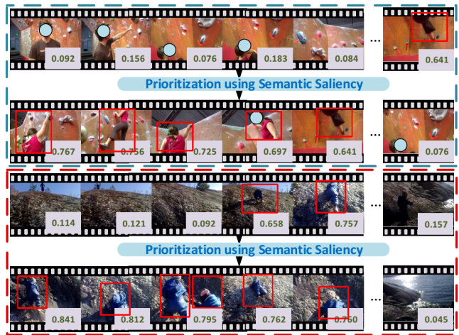
Figure 1. Two Internet video examples, where the same event Rock Climbing happened in very different time frames. The number in each frame indicates its saliency score, which describes how this keyframe is relevant to the specified event. We use this saliency information to prioritize the video shot representations.

Proceedings of the 32 nd International Conference on Machine Learning, Lille, France, 2015. JMLR: W&CP volume 37. Copyright 2015 by the author(s).