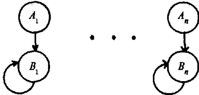
Figure 4-1: Example to Illustrate Restrictions on ICTL *

We will use \bigwedge_i f(i) as an abbreviation for \neg \bigvee_i \neg f(i) .