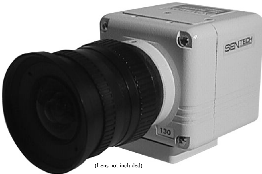
(Lens not included)

The STC-630BT color camera provides excellent performance utilizing 10 bit digital signal processing (DSP). The camera features high quality color reproduction, a 1/3" high resolution IT CCD, electronic shutter to 1/10,000 of a second and composite video output. The STC-630BT is available in NTSC and PAL formats.