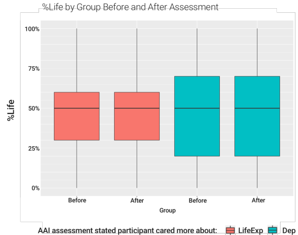
Figure 1: Study 1: medians and first/third quartiles for %Life, before and after assessment for each participant

Participants were presented with background information on kidney allocation and about the patient features in this survey. On our online platform, participants were asked to make decisions on