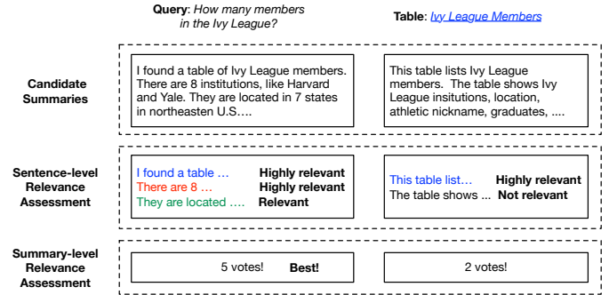
Figure 2: Illustration of our crowdsourcing workflow.

As shown in Fig 2, we show the question, the title of the table, and its Wikipedia page link to the crowd worker. The worker needs