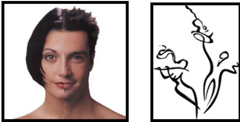
Figure 1. Two inherently different images that share the same ESP labels: “man” and “woman.” The Phetch descriptions, however, are different: “half-man half-woman with black hair” and “an abstract line drawing of a man with a violin and a woman with a flute.”

One possible approach to assigning descriptions to images in order to improve accessibility is the ESP Game, which allows people to label images while enjoying themselves [1]. The game collects random images from the Web and outputs keyword labels that describe the contents of the images. For example, for an image of a cat and a dog, the ESP Game outputs “cat,” “dog,” “animals,” etc. If all images on the Web were labeled by the ESP Game, screen readers could use these keywords to point out the main features of an image. This, however, can be vastly improved. While keyword labels are perfect for certain applications such as image search, they may be insufficient for describing the contents of a picture. This is demonstrated in Figure 1. We therefore design a different game that collects sentences instead of keyword descriptions. We further show below that the descriptions collected using our game are significantly more expressive than the keywords collected using the ESP Game.