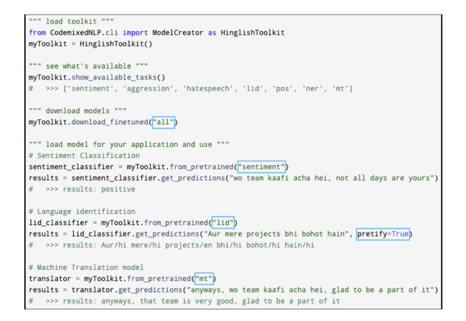
Figure 2: Command line interface for utilizing fine-tuned models. We provide several functionality compatible with the popular Huggingface and Fairseq libraries. Marked in boxes are customizable input arguments.

Among many potential research applications of our toolkit, in this section, we demonstrate one – benchmarking . Table 1 presents performances of selected model architectures obtained using our toolkit on some popular mixed datasets. In Table 2, we also demonstrate the performances of different architectural choices implemented through our toolkit on two Hinglish datasets. For domain-adaptive pretraining of Hinglish datasets, we collate around 160K mixed sentences from several of the publicly available Hinglish datasets.