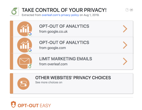
Figure 1: The results from Opt-Out Easy, a browser extension to extract opt-out choices from privacy policies, for Overleaf.com (Bannihatti Kumar et al., 2020).

policy, labeling different types of opt-out choices, with a particular emphasis on extracting actionable choices in the policy, i.e. those associated with hyperlinks. Bannihatti Kumar et al. (2020) develop a web-browser extension to present extracted choice instances to users (Figure. 1), finding that the tool can considerably increase awareness of choices available to users and reduce the time taken to identify actions the users can take.