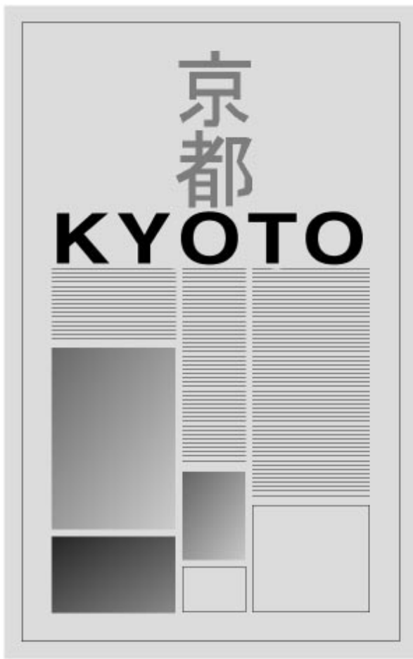
Figure 4: Page layout.

mations are part of the allowable set of transformations during discrete search. A sample configuration of the circuit board is shown in figure 3.