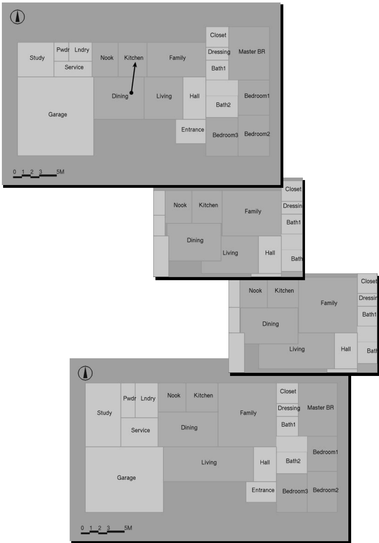
Figure 2: Architectural room layout. (top) The user pulls on the dining room, and a discrete change occurs. (middle) Two intermediate frames from the resulting animated transition. (bottom) The new configuration.