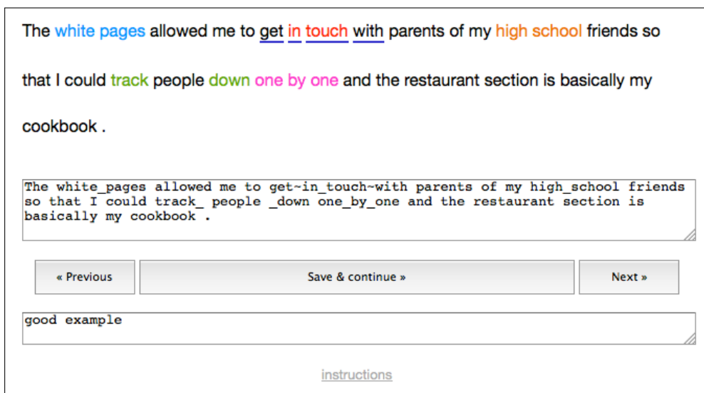
Figure 3: MWE annotation interface. The user joins together tokens in the textbox, and the groupings are reflected in the color-coded sentence above. (Invalid markup results in an error message.) A second textbox is for saving an optional note about the sentence. The web application also provides capabilities to see other annotations for the current sentence and to browse the list of sentences in the corpus (not shown).

tic manipulations and substitution of synonyms/antonyms, along with informal web searches, were often used to investigate the fixedness of candidate MWEs; a more systematic use of corpus statistics (along the lines of Wulff, 2008) might be adopted in the future to make the decision more rigorous. Annotation guidelines. Annotation conventions were recorded on an ongoing basis as the annotation progressed. The guidelines document describes general issues and considerations (e.g., inflectional morphology; the spans of named entities; date/time/address/value expressions; overlapping expressions), then briefly discusses about 40 categories of constructions such as comparatives ( as X as Y ), age descriptions ( N years old ), complex prepositions ( out of , in front of ), discourse connectives ( to start off with ), and support verb constructions ( make a decision , perform surgery ).