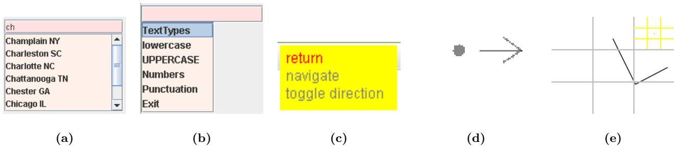
Figure 3: Example IAT adaptations. (a) For keyboard-only input IAT replaces a list with an interactor that prunes items based on entered text. (b) For switch input, IAT replaces a textfield with an interactor that allows the user to select specific characters one at a time. (c) For switch input, IAT uses a popup menu to allow the user to select between navigation or interaction. (d) For switch input, IAT augments canvases with a drawing dot and direction arrow that users can manipulate. (e) For speech input, IAT augments canvases with a grid-based selection tool (the black lines are on the canvas itself).

In the pointer case, no navigation adaptations are necessary. IAT does not augment navigation for pointers .