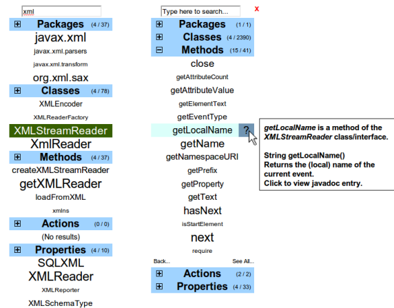
Figure 2. Demonstration of accordion expansion, text searching and informational popups.

The ability to search a column for particular keywords was added since it was a highly requested feature, allowing users to quickly jump to a particular item if they already have one or more words in mind. Filtering occurs instantaneously – the column's content adjusts with each additional keystroke, providing continuous results as the user refines the query. The search mechanism also handles multiple keywords by modifying the ranking system to reflect how