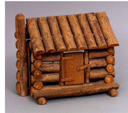
Carl Sandburg NHS, nps.gov