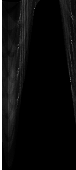
Figure 2: Hough transform result.

The accumulator resolution needs to be selected carefully. If the resolution is set too low, the estimated line parameters might be inaccurate. If resolution is too high, run time will increase and votes for one line might get split into multiple cells in the array. Your code cannot call Matlab’s hough function, or any other similar functions. You may use hough for comparison and debugging. A sample visualization of H is shown in Figure 2.