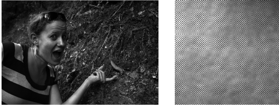
Figure 6: Left: The linear RAW image (brightness increased by 5). Right: Crop showing the Bayer pattern.

For example, Figure 6 shows what you should see using this command after the linearization step.