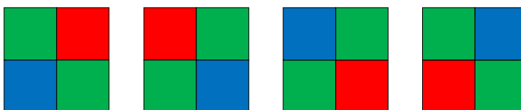
Figure 3: From left to right: 'grbg', 'rggb', 'bggr', 'gbrg'.

However, we do not know how the Bayer pattern is positioned relative to our image: If you look at the top-left 2 \times 2 image square, it can correspond to any of the four red-green-blue patterns shown in Figure 3.