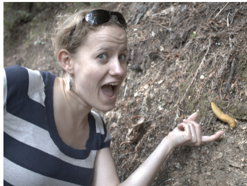
Figure 1: One possible rendition of the RAW image provided with the assignment.

Throughout this problem, you will use the file banana_slug.tiff included in the ./data directory of the homework ZIP archive. This is a RAW image that was captured with a Canon EOS T3 Rebel camera. We did some very slight pre-processing to the original RAW file, in order to convert it to .tiff format. At the end of this assignment, the image should look something like what is shown in Figure 1. The exact result can vary greatly, depending on the choices you make in your implementation.