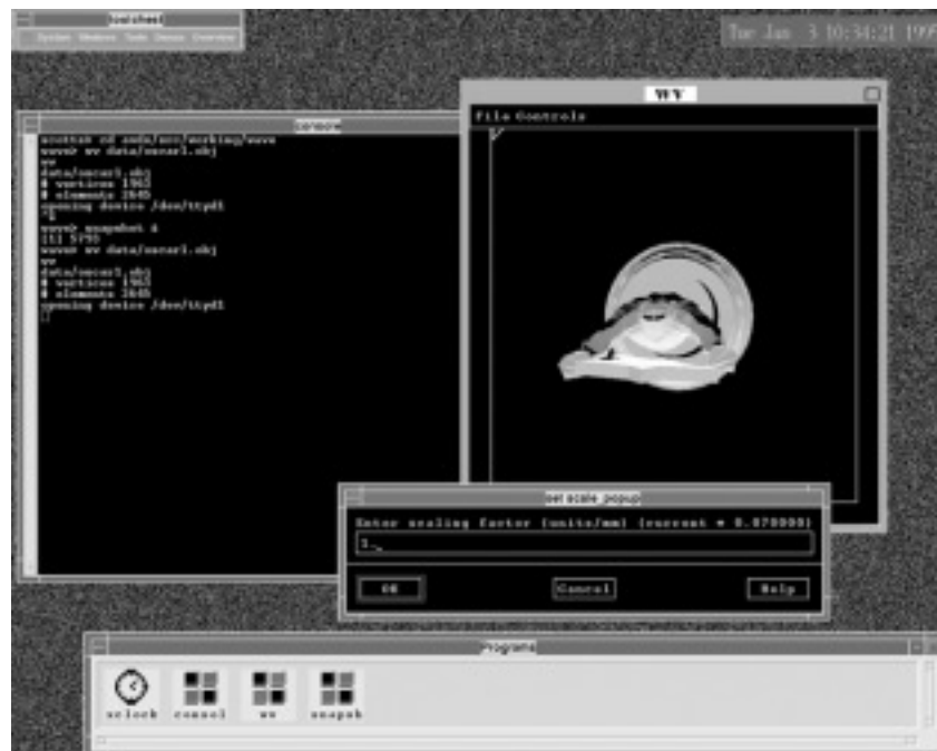
Figure 2: Stereo-in-a-window application