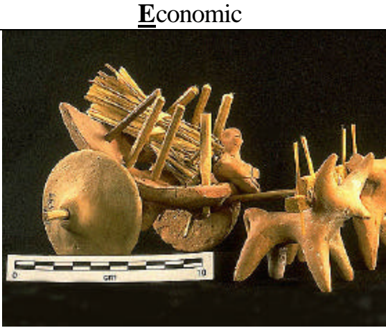
This is a figurine of an ox-drawn cart.

It is political by showing the dominating ruler. His ornate decoration shows him to be a person of significance and conveys the king to be a ruler of luxury.