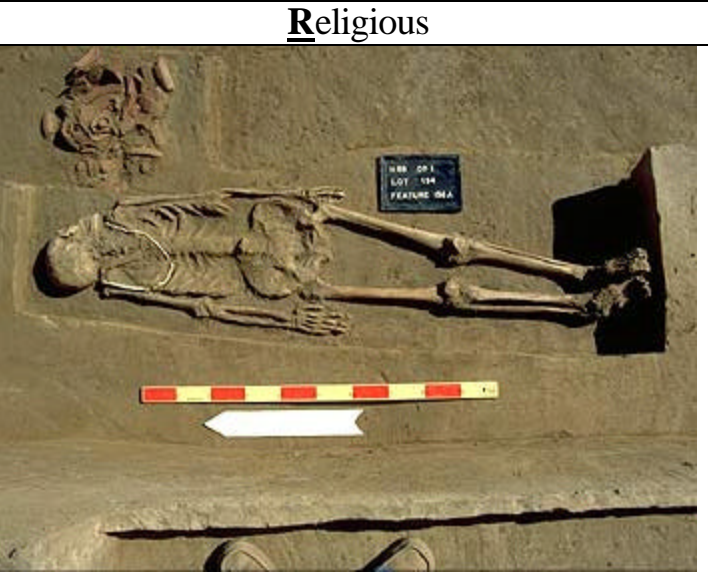
This is a burial of a Man, which was excavated quite recently.

It is economic because it shows the usage of animal labor for moving agricultural goods. In addition, it shows how there was a movement of grains and materials in the region.